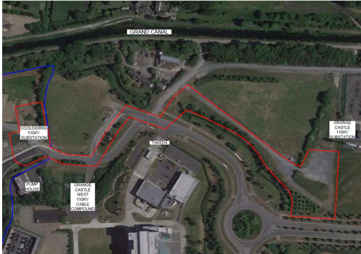
Figure 2.1 Site location of Proposed Development site

The two proposed underground single circuit 110kV transmission lines will connect the permitted Coolderrig 110kV GIS Substation to the existing Grange Castle - Kilmahud Circuits to the east. The proposed parallel transmission lines cover a distance of approximately 559m and 574m within the townland of Grange, Dublin 22. They will pass outside of the site and along and under the internal road infrastructure within the Edgeconnex site and Grange Castle Business Park; above the culverted Griffeen River and along a wayleave to the north of the Griffeen River to the joint bays where it will connect into the Kilmahud Circuit.